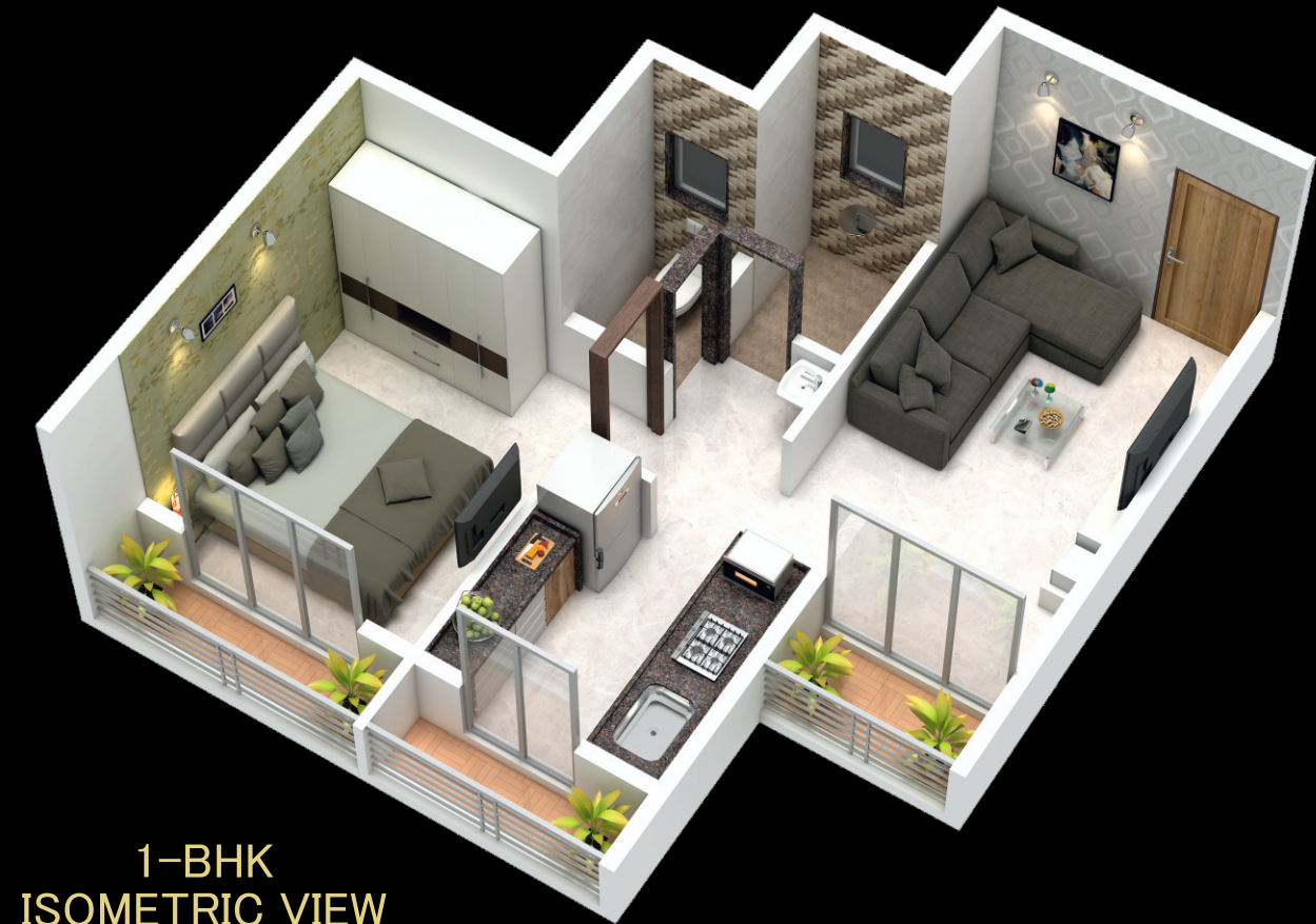
1-BHK ISOMETRIC VIEW