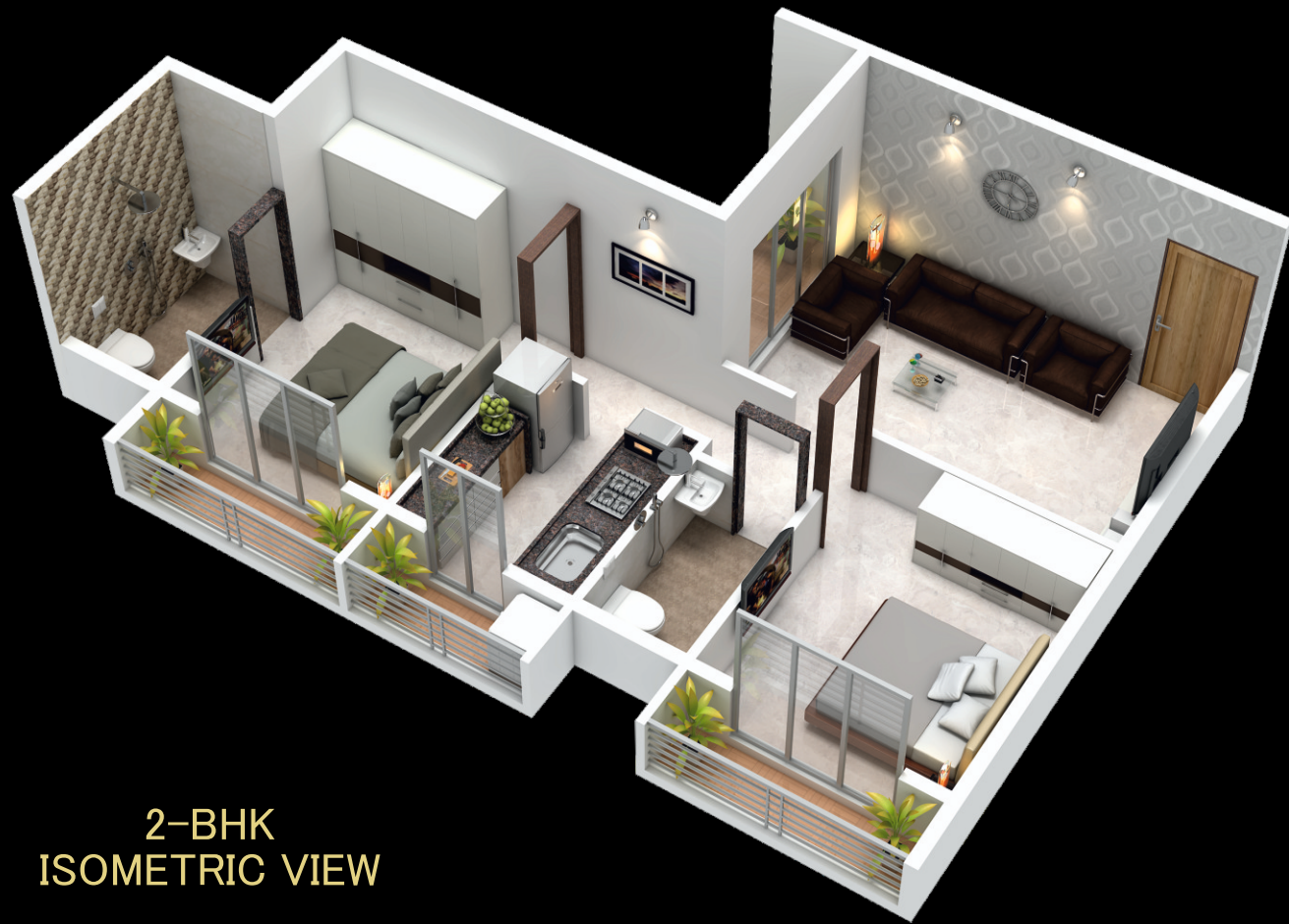
2-BHK ISOMETRIC VIEW